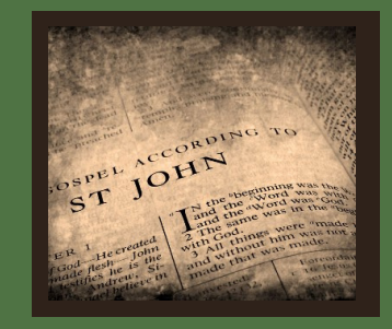
Mayslake Ministries Biblical Institute

Our instructors share a passion for helping adults experience the power of God's Word. The goal of this ministry is to deepen the understanding, faith and practice of all who participate in the Biblical Institute.